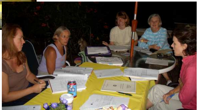
HLWV Board Members busy at work, planning the new year.