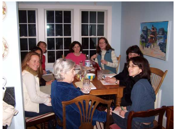
The HLWV Board working hard in January.

The seminars will occur on the Wednesday mornings of March 12, 19, and 26, and April 2 and 9, beginning at 9:30 a.m. and ending at 12:30 p.m., except for the final day, which will end at 1 p.m.